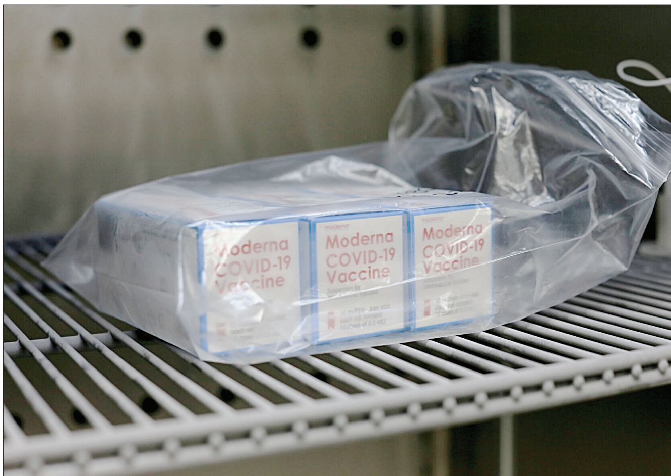
Packages of the Moderna COVID-19 vaccine sit in cold storage Aug. 13, 2021, in the Cameron County Public Health's pharmacy in San Benito, Texas. The Food and Drug Administration has authorized another booster dose of the Pfizer or Moderna COVID-19 vaccine for people age 50 and up, Tuesday, March 29, 2022.

The move comes at a time of great uncertainty. COVID-19 cases have dropped to low levels after the winter surge of the super-contagious omicron variant. Two vaccine doses plus a booster still provide strong protection against severe disease and death,