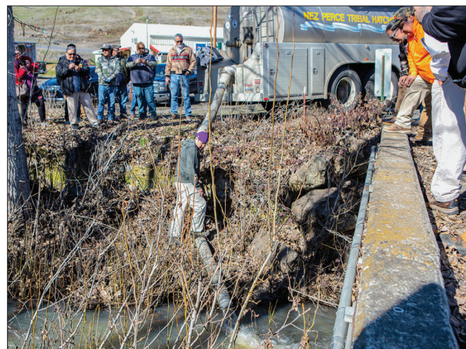
Members of the Nez Perce Tribe watch as thousands of juvenile spring chinook are released on Wednesday, March 9, 2022, into Sweetwater Creek near Webb.

Spring chinook were extirpated from the Clearwater Basin with the construction of the Lewiston