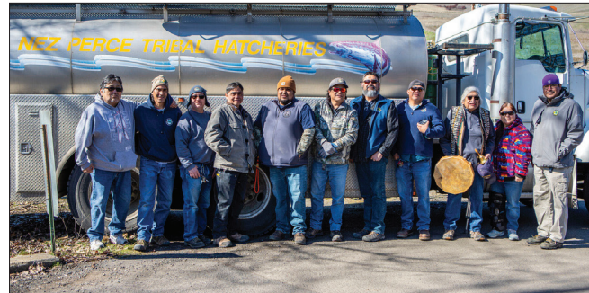
Members of the Nez Perce Tribe pose for a photo in front of the tribe's hatchery truck on Wednesday, March 9, 2022, after releasing thousands of juvenile spring chinook into Sweetwater Creek near Webb.

Dam in 1927. When the dam was removed in the 1970s, a hatchery spring chinook program was established in the basin.