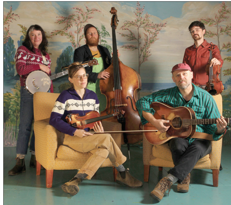
Portland band Horse Feathers is the first concert of 2022 at HQ in La Grande. They appear March 24.

Horse Feathers will release a deluxe re-issue LP of their breakthrough 2008 album, "House With No Home," on April 8, courtesy of Kill Rock Stars. The formerly out-of-print LP is being remastered from the original audio, and will include a bonus of unreleased material. The New York Times described it as "a lovely, lo-fidelity meditation, full