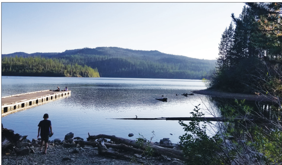
Olive Lake is in the Blue Mountains west of Granite.

The campground is 12 miles northeast of Tollgate and is the largest developed campground on the Umatilla National Forest, with 53 campsites, four