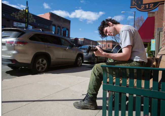
A guitarist plays in downtown Sandpoint, Idaho, a town of 8,900 on the shores of Lake Pend Oreille. The mayor of Sandpoint and many residents worry that the trend of a growing number of real estate companies advertising to conservatives that they can help people move out of liberal bastions like Seattle and San Francisco and find homes in places like rural Idaho is not good for their community.