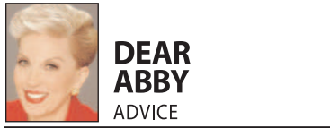
DEAR ABBY ADVICE