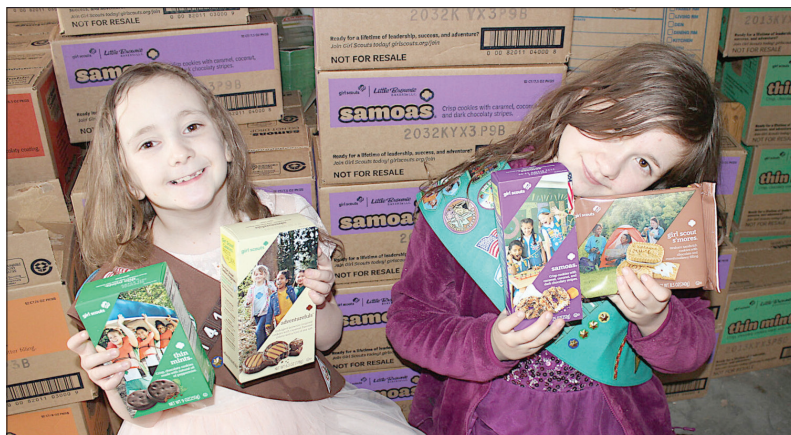
Girl Scouts will again be selling cookies at booths around Eastern Oregon. To find a location, go to girlscoutcookies.org and enter your ZIP code.

The return is, however, not without its challenges as Girl Scouts are facing shipping delays and delivery challenges. Although the cookie season could last until March 20, troop leaders said that will depend