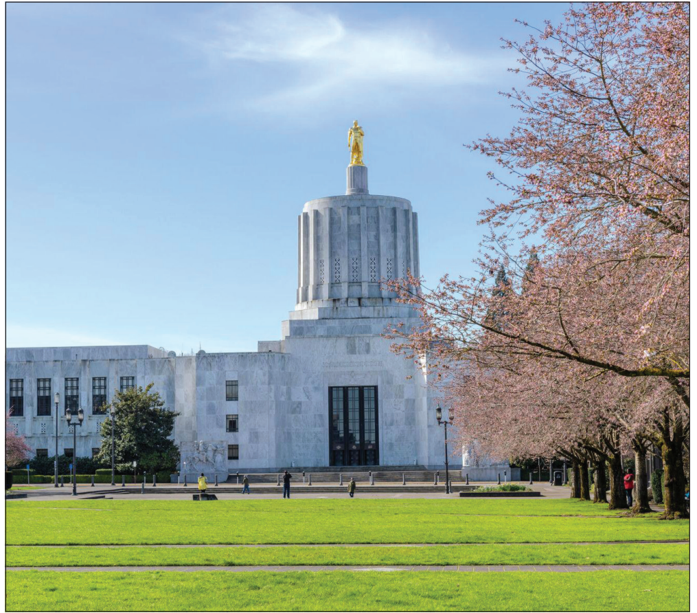
The Oregon Capitol in Salem.