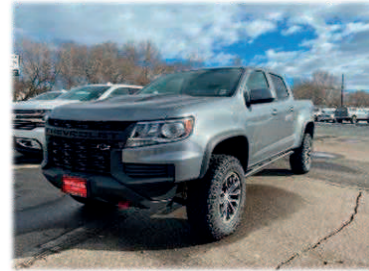
Colorado ZR2 DIESEL