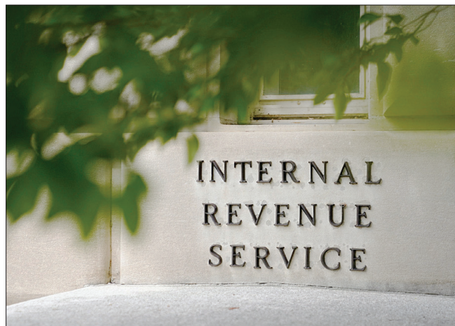
A sign is displayed outside the Internal Revenue Service building May 4, 2021, in Washington. A private company, enQ, lets those who are willing to pay jump to the front of the line to get their phone calls answered at the IRS. That has attracted the attention of lawmakers who want the IRS to investigate the company's impact on the agency's phone capacity.

way to get quick access to what should be a free government service equally available to all. Members of Congress from both parties have concerns, too. The service was expected to come up on Thursday, Feb. 17, during the Senate Finance Committee's hearing on customer service problems at the IRS, where call volumes have reached record levels. "No taxpayers should have to fork over $1,000 to a private company to get their phone calls answered by the IRS. It's maddening," committee chairman Sen. Ron Wyden, D-Oregon, wrote in an email to the AP. "Rebuilding this agency so it can serve hardworking taxpayers is a top priority, and the committee will again examine the issue this week." Last November, Sens. Bill Cassidy, R-La.; Todd Young, R-Ind.; Bob Menendez, D-N.J.; and Mark Warner, D-Va., wrote