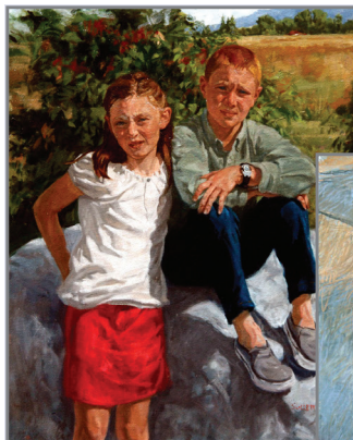
above: Oil, right: Pastel