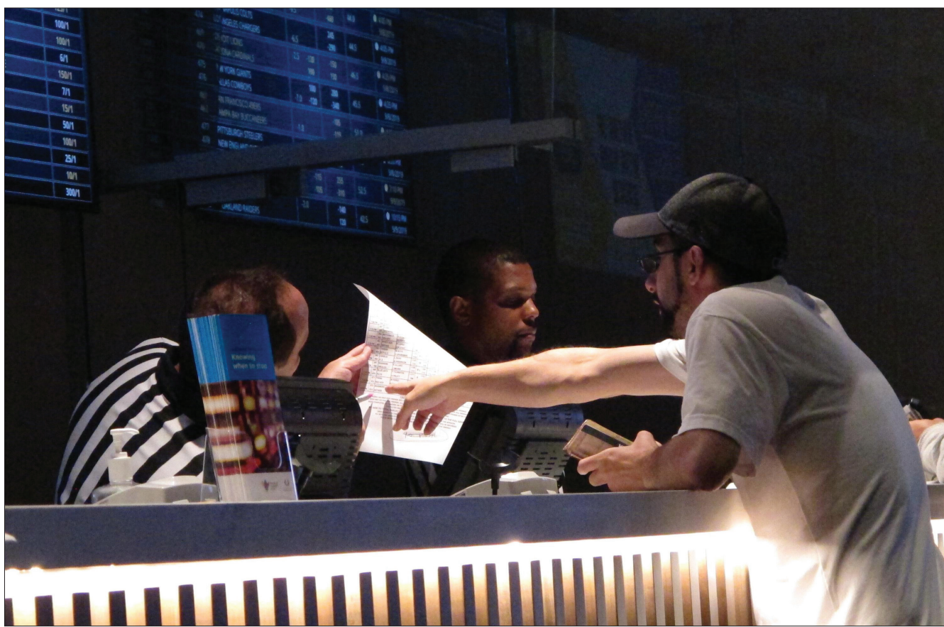
A gambler makes a sports bet at Bally's casino in Atlantic City N.J., Sept. 5, 2019. A record 31.5 million Americans plan to bet on this year's Super Bowl, according to the gambling industry's national trade group. The American Gaming Association on Tuesday, Feb. 8, 2022, released its annual predictions for wagering on pro football's championship game, forecasting that over $7.6 billion will be bet legally and otherwise.

Since last year's game, 45 million additional people will be able to bet on the Super Bowl because their states have legalized sports betting over the past year: Arizona, Connecticut, Lou-