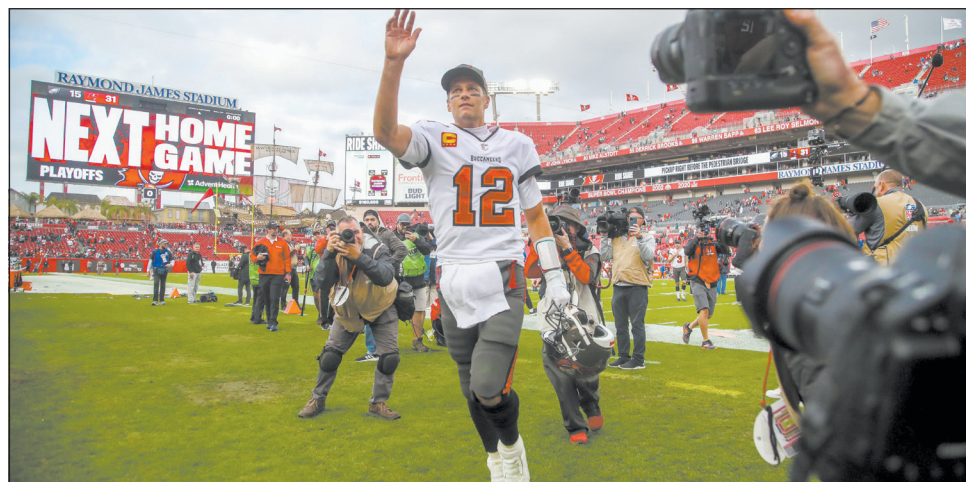
Tampa Bay Buccaneers quarterback Tom Brady waves to fans while walking off the field after the Tampa Bay Buccaneers defeated Philadelphia Eagles 31-15 Sunday, Jan. 16, 2022, in Tampa.