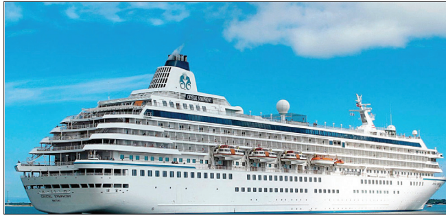
The cruise liner Crystal Symphony leaves the harbor in Charleston, S.C., on May 21, 2013. Scheduled to arrive in Miami on Saturday, Jan. 22, 2022, the ship, with hundreds of passengers aboard, was diverted to the Bahamas after a U.S. judge granted an order to seize the vessel as part of a lawsuit over unpaid fuel.

The ship was scheduled to land in Miami on Jan. 22. But a federal judge in Miami issued an arrest warrant for the ship on Jan. 20, a maritime practice where a U.S. Marshal goes aboard the vessel and takes charge of it once it enters