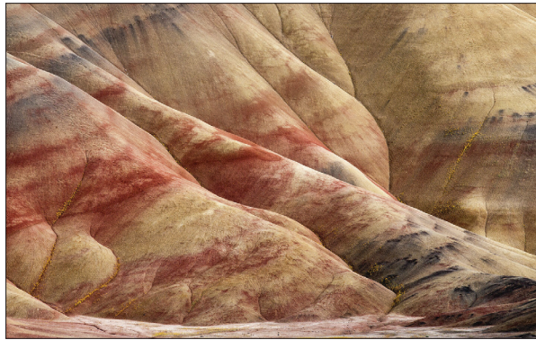
"Climates Through Time," photo on wood, by Ellen Morris Bishop

"We usually observe nature as discrete, recognizable subjects: a mountain, a bird, a tree, a river, etc. But in reality, our view of nature is composed of textures, shapes, forms and colors. We often fail to recognize these telling patterns when viewing a familiar object or scene. This exhibit encourages artists to examine and reveal nature beyond the fa-