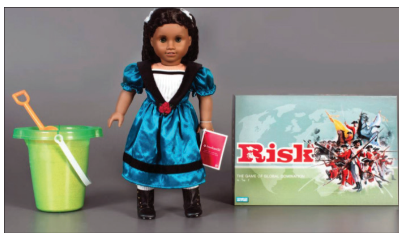
shows the three toys being inducted this year into the National Toy Hall of Fame. They are, from left: sand, The American Girl Doll, and the game of Risk, that are being enshrined during a ceremony at the hall, located inside The Strong National Museum of Play, in Rochester, NY.