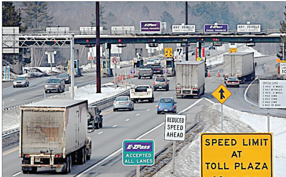
Traffic approaches Maine Turnpike toll booths in Gardiner, Maine, in this Feb. 2011 file photo. A Maine law banning obscene license plates went into effect Monday, Oct. 18, 2021, but getting the foul language off the roads and highways won't happen overnight.