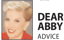
DEAR ABBY ADVICE

Dear Abby: Thirty-five years ago I was raped by a stranger. He told me he would kill me if I ever told anyone. I never told my husband (now ex), mostly because I was afraid if I did he would never touch me again. So I lived with the secret. It eventually tore our marriage apart and we divorced.