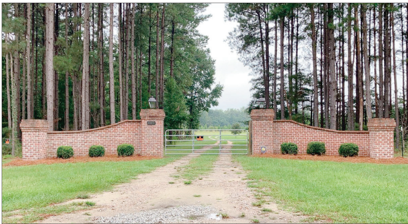
The gates near Alex Murdaugh's home in Islandton, S.C., are seen in this Monday, Sept. 20, 2021 photo. State police have six separate investigations into Murdaugh and his family after his wife and son were shot to death outside the home in June.

Six investigations are underway, over the killings, stolen money, death coverups and a Sept. 4 shooting in which a bullet grazed Murdaugh's head on a lonely highway. Police said he tried to arrange his