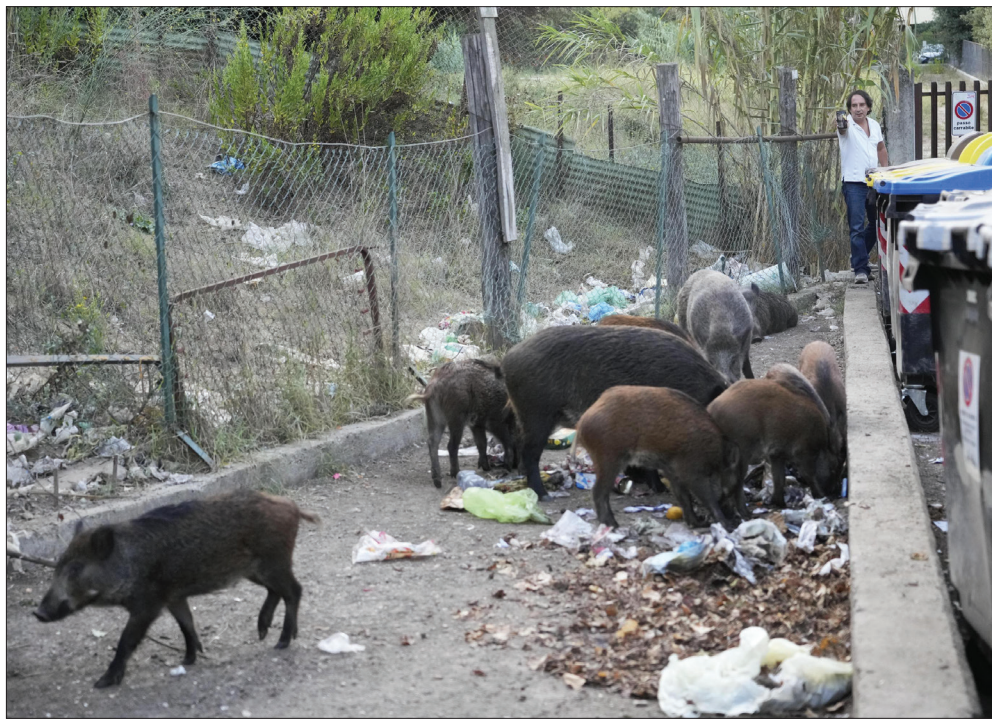
Wild boars forage near trash bins in Rome, Friday, Sept. 24, 2021. They have become a daily sight in Rome, families of wild boars trotting down the city streets, sticking their snouts in the garbage looking for food.

As Rome gears up for a local election next weekend, the wild boar invasion has been used as a political weapon to attack Mayor Virginia