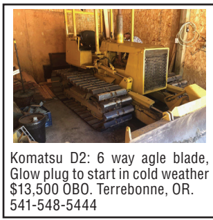
Komatsu D2: 6 way angle blade, Glow plug to start in cold weather $13,500 OBO. Terrebonne, OR. 541-548-5444

These little ads really work! Join the thousands of other people in this area who are regular users of the classified. See how simple and effective they can be. We're open from 7:30 a.m. to 5 p.m. for your convenience.