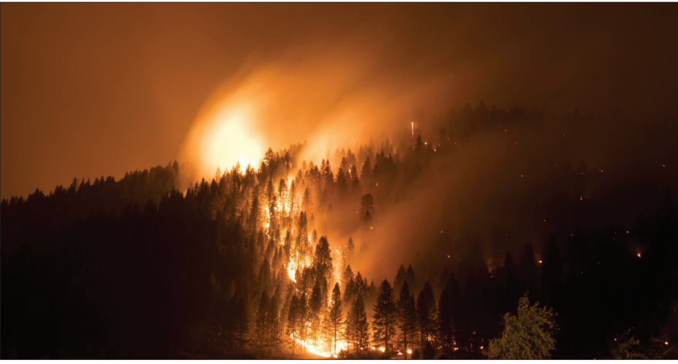
Flames consume trees Aug. 21, 2021, during the Dixie Fire in Genesee, California. Punishing heat waves have plagued the West all summer and, even at the brink of fall, another sweltering blast has moved over the region.

The excessively high temperatures of the moment are being generated by a large and unusually strong zone of high pressure or heat dome parked over the