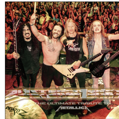
Metallica tribute band Blistered Earth plays at Baker City's Ison House Friday, Sept. 3.

"The word really spread. Eventually it got back to Metal-