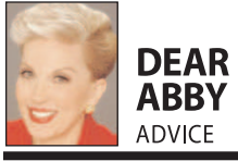
DEAR ABBY ADVICE

Dear Abby: When I was an unmarried 18-year-old, I had a child out of wedlock. Unsure that I could provide for him, I chose to place him for adoption so he would have a chance for a better life. This year, we connected through DNA. The reunion has been great, even though I choose to remain in the background because his mother is still living.