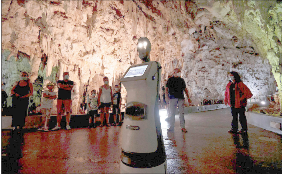
Persephone guides the visitors inside Alistrati cave, about 84 miles northeast of Thessaloniki, Greece, on Aug. 2, 2021. Persephone, billed as the world's first robot used as a tour guide inside a cave, has been welcoming visitors to the Alistrati cave since mid-July.

The robot can give its part of the tour in 33 lan-