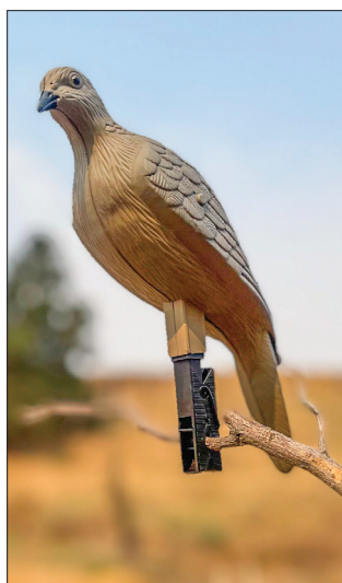
A static dove decoy perched visibly on a tree branch placed for good visibility.

Nonmobile (static) decoys work well on their own, but another option is to include a spinning-wing decoy to animate your spread. Doves approach an animated, spinning-wing decoy head-on most often, which can aid in setting up that textbook crossing shot.