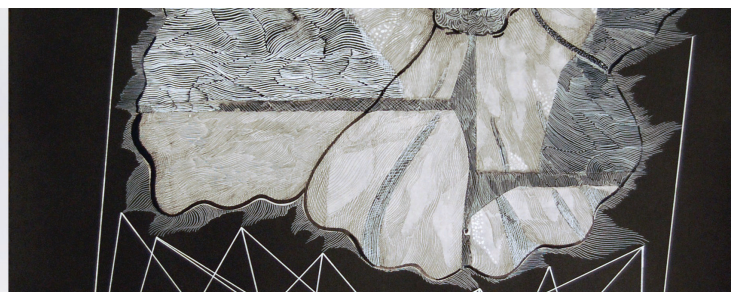
Detail: Kirsten Furlong in EO Gallery NOW