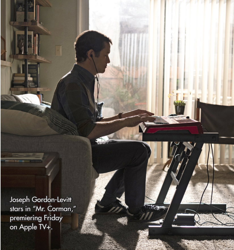
Joseph Gordon-Levitt stars in "Mr. Corman," premiering Friday on Apple TV+.

Josh Corman is a man underwhelmed by life and himself. As played by Joseph Gordon-Levitt ("Third Rock From the Sun," "Lincoln") in the Apple TV+ comedy series "Mr. Corman," which begins streaming Friday, Aug. 6, he's a 30-something born and raised in the suburbs of Los Angeles whose life hasn't turned out as he envisioned.