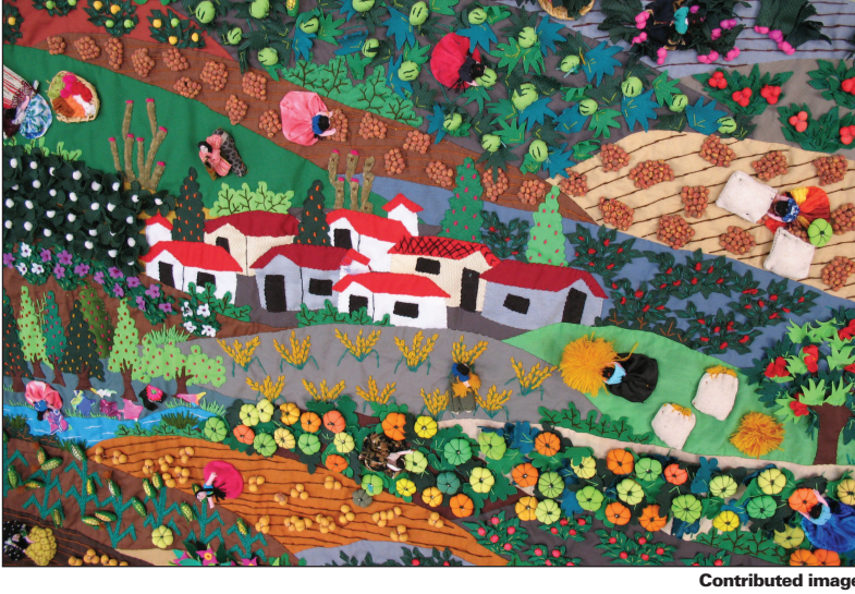
Peruvian "cuadros" will be on display at Crossroads Art Center.

Cody's Paint Studio will join the First Friday art walk this month to showcase upcycled furniture. Cody's General Store and the paint shop, located in Basche-Sage Place, will be open late on July 2.