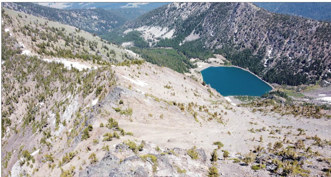
Goodrich Lake from the summit of Elkhorn Peak on June 19, 2021.

Almost directly below to the east — and about 2,300 vertical feet — is Goodrich Lake. The lake is a supplementary water