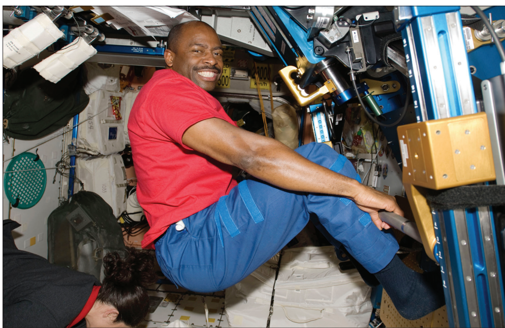
Astronaut Leland Melvin, STS-129 mission specialist, exercises in the International Space Station while the space shuttle Atlantis is docked with the station on Nov. 22, 2009. Space station astronauts exercise two hours every day to counter the muscle- and bone-withering effects of weightlessness, quickly leaving their workout clothes sweaty, smelly and stiff. Their T-shirts, shorts and socks end up so foul that they run through a pair every week, according to Melvin, a former NASA astronaut and NFL player.

The Cincinnati company announced Tuesday, June 22, that it will send a pair of Tide detergent and stain removal experiments to the space station later this year and next, all part of