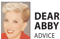
DEAR ABBY ADVICE

Dear Abby: I went to lunch with “Anita,” who proceeded to question me about how I know my friend “Gail.” It seems like an innocent question, but Gail and I met in Alcoholics Anonymous. I didn’t tell Anita we met in AA because it would’ve destroyed Gail’s anonymity, so I said we met through mutual friends.