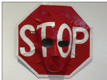
Art Center East Contributed Photos

A virtual tour of "Missing Your Face" is available to all. Go to www.artcentereast.org , choose "Main Exhibit" then click on the link to the tour.