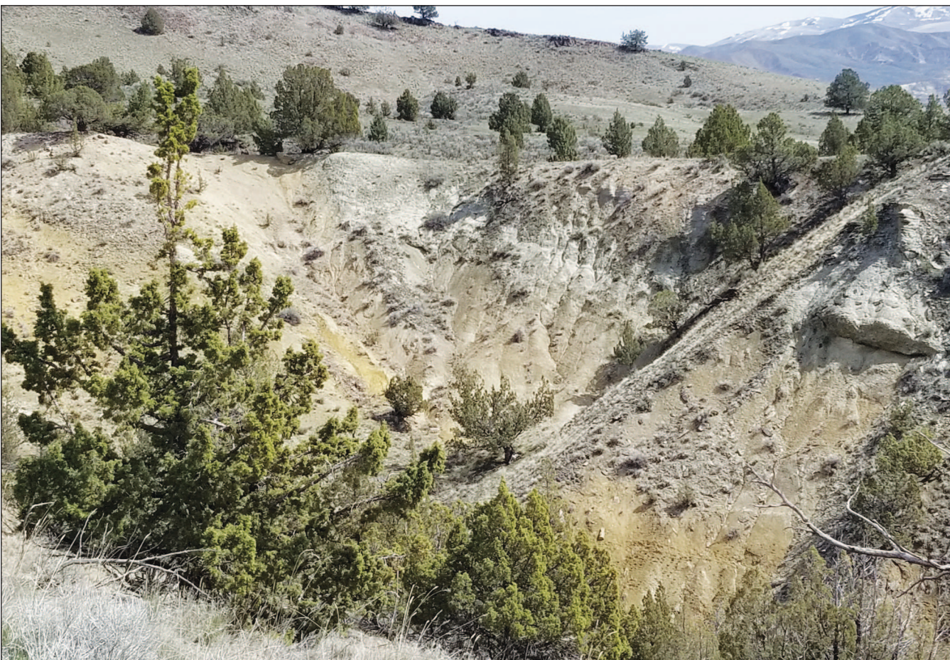
Colorful beds of rock and ash in the hills above the Durkee Valley of southeast Baker County.