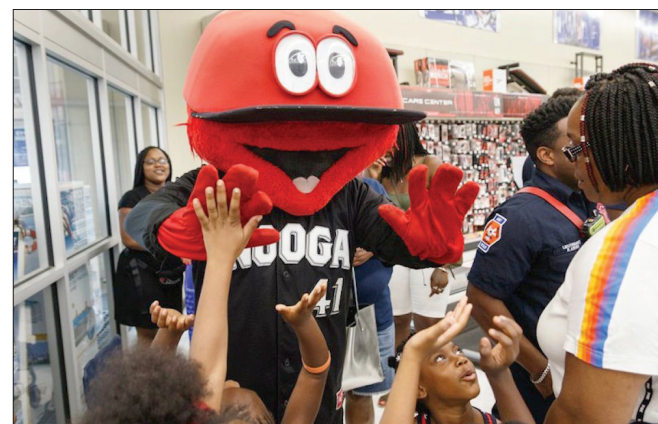
Children from the YMCA Westside and Salvation Army high-five Looie the Lookout on July 18, 2019, in Chattanooga, Tennessee. The Chattanooga Lookouts announced Wednesday, March 31, 2021, on Twitter that the costume for Looie the Lookout has been returned home safe. The team told authorities the mascot's costume was stolen from an office at AT&T Field on Tuesday, along with merchandise and equipment.

The Lookouts told authorities the mascot's costume was stolen from an office at AT&T Field on Tuesday, according to a Facebook post from Chattanooga police. Looie's head