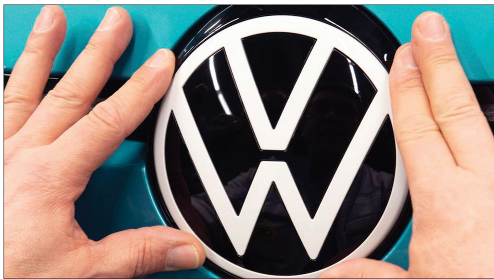
A worker completes an electric car ID.3 body at the assembly line Tuesday, Feb. 25, 2020, during a press tour at the plant of the German manufacturer Volkswagen AG (VW) in Zwickau, eastern Germany.

In that scandal, Volkswagen admitted that about 11 million diesel vehicles worldwide were fitted with the deceptive software. The software reduced nitrogen oxide emissions when the cars were placed on a test machine but allowed higher