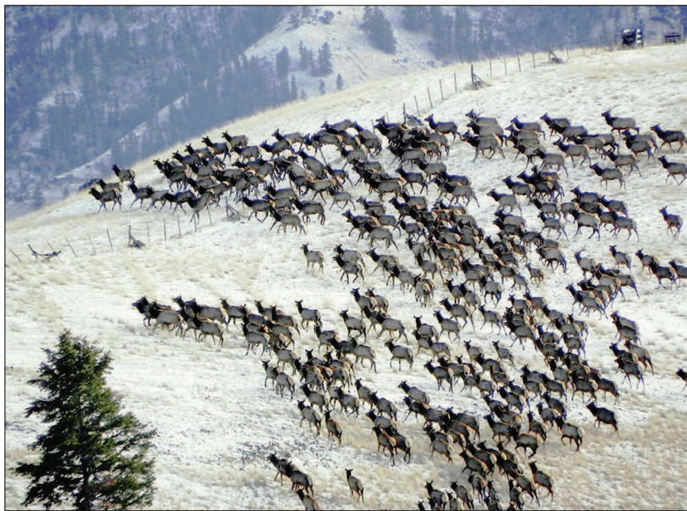
A large herd of elk on the Zumwalt Prairie in Wallowa County.