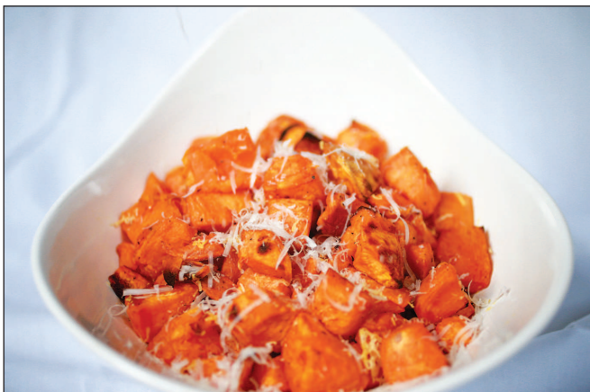
Parmesan sweet potatoes.