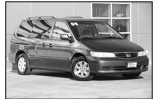
2004 Honda Odyssey ex $49 down $79 per month. Stk# 18707a