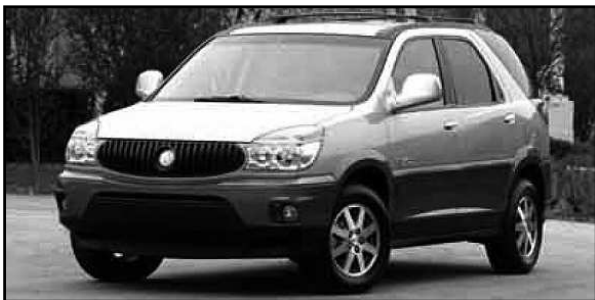
2003 Buick Rendezvous AWD $49 down $49 per month. Stk# 18709b

Ontario, OR - Local dealership announces a huge inventory "Blow-out Sale". Vehicles are going to be selling for thousands of dollars less for 10 days only. For example: Vehicles will be available for $49 down and $49 per month*. In light of overstocked inventory,