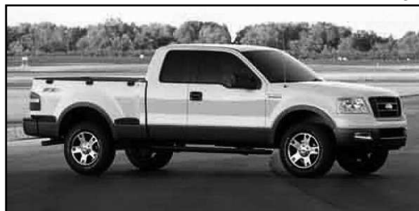
2004 Ford F-150 4wd $49 down $69 per month. Stk# 18741b