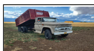
1983 Chevrolet Grain Truck $5000, La Grande 541-786-1456

Give your budget a boost. Sell those still-good but no longer used items in your home for cash. Call the classified department today to place your ad.