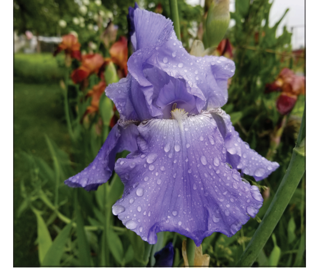
An iris dappled with water after a rain shower.

If you have garden questions or comments, please write to greengardencolumn@yahoo.com. Thanks for reading!