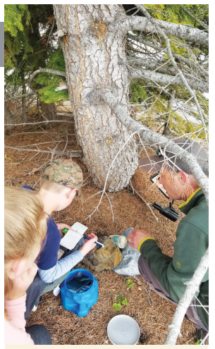
Exploring a geocache

Serving Baker County since 1870 • bakercityherald.com