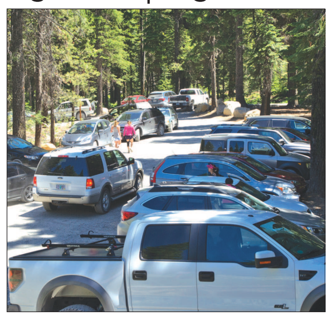
Cars and pedestrians navigate through the busy Tumalo Falls parking lot in Central Oregon.

park Smaller state campgrounds also saw big growth, from Viento in the