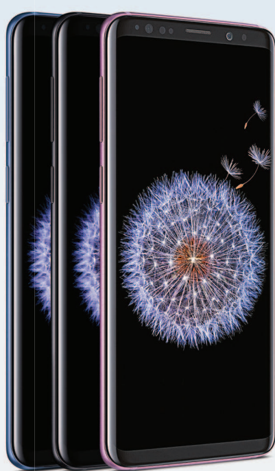
SAMSUNG Galaxy S9

NO TRADE-IN REQUIRED — FREE — SAMSUNG GALAXY S9 WHEN YOU SWITCH