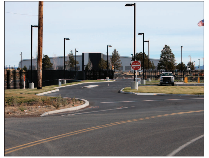
WesCom News Archive

Recently, the company pledge $9 million to build an underground water storage facility to help meet demands of their data center.