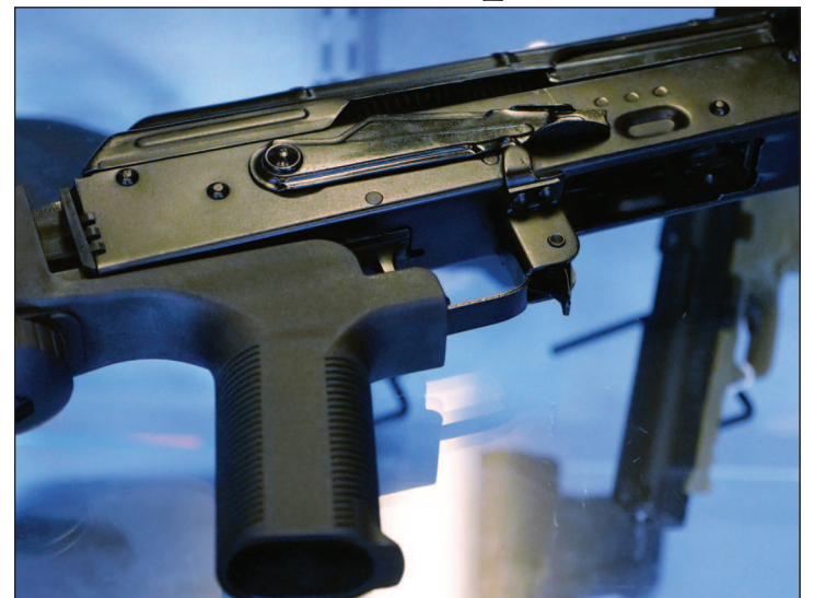
WesCom News Archive

The Bureau of Alcohol, Tobacco and Firearms... See Bump stocks / Page 2B