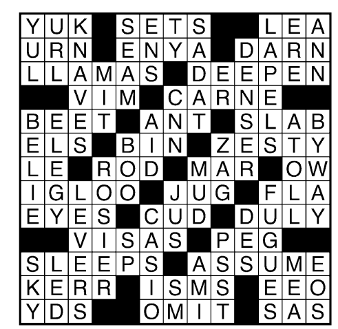
11-30-18 © 2018 UFS, Dist. by Andrews McMeel for UFS