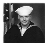
Cliff Robertson Navy