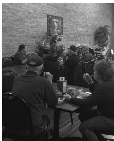
PUBLIC ROUND TABLE MEETINGS