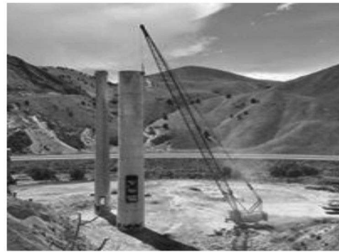
2018 LIME PLANT DEMOLITION