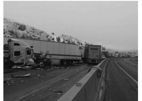
2015 ICE STORM CLOSURES I-84