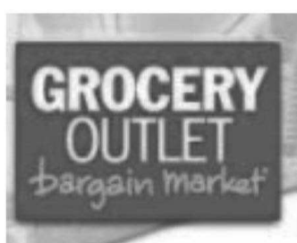
2018 NEW STORE 60 NEW JOBS