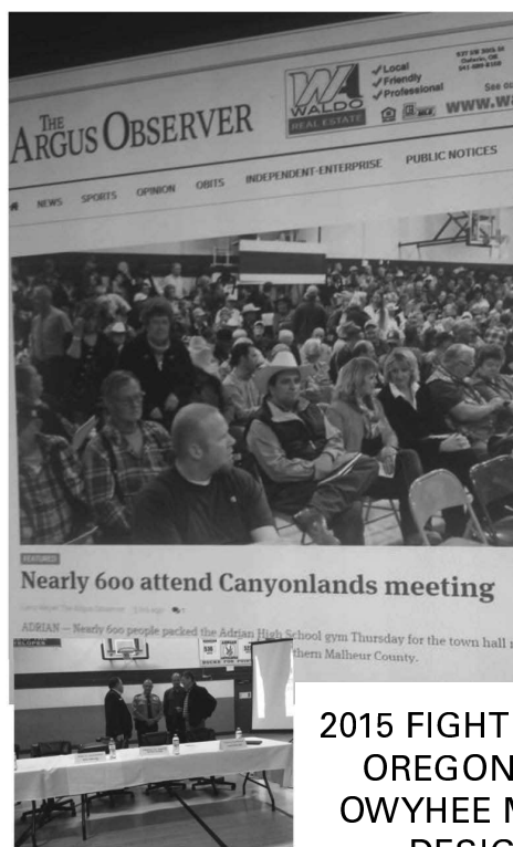
2015 FIGHTING AGAINST OREGON WILD AND OWYHEE MONUMENT DESIGNATION

Thousands of you followed us on FACEBOOK FOR INFORMATION