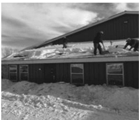
2016-2017 RECORD BREAKING SNOW