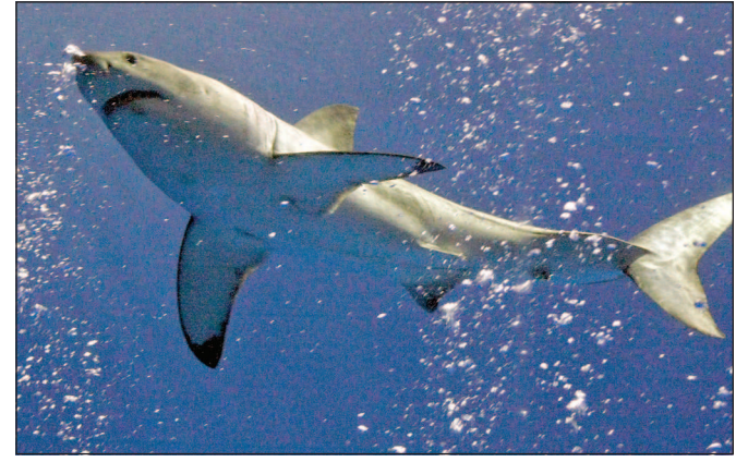
WesCom News Archive

"They're there, just as much as the sunrise and