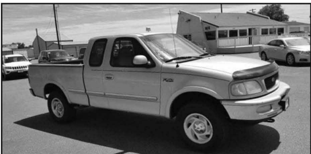
1997 Ford F-150 4WD Stk# 27818A

Ontario, OR - Local dealership announces a huge inventory “Blow-out Sale”. Vehicles are going to be selling for thousands of dollars less for 10 days only. For example: Vehicles will be available for $49 down and $49 per month*. In light of overstocked inventory,