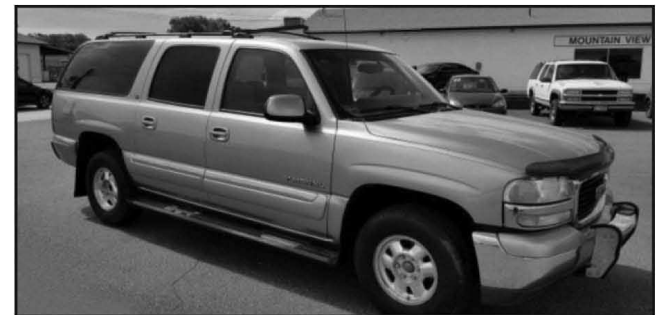
2000 GMC Yukon XL 4WD Stk# 15634B