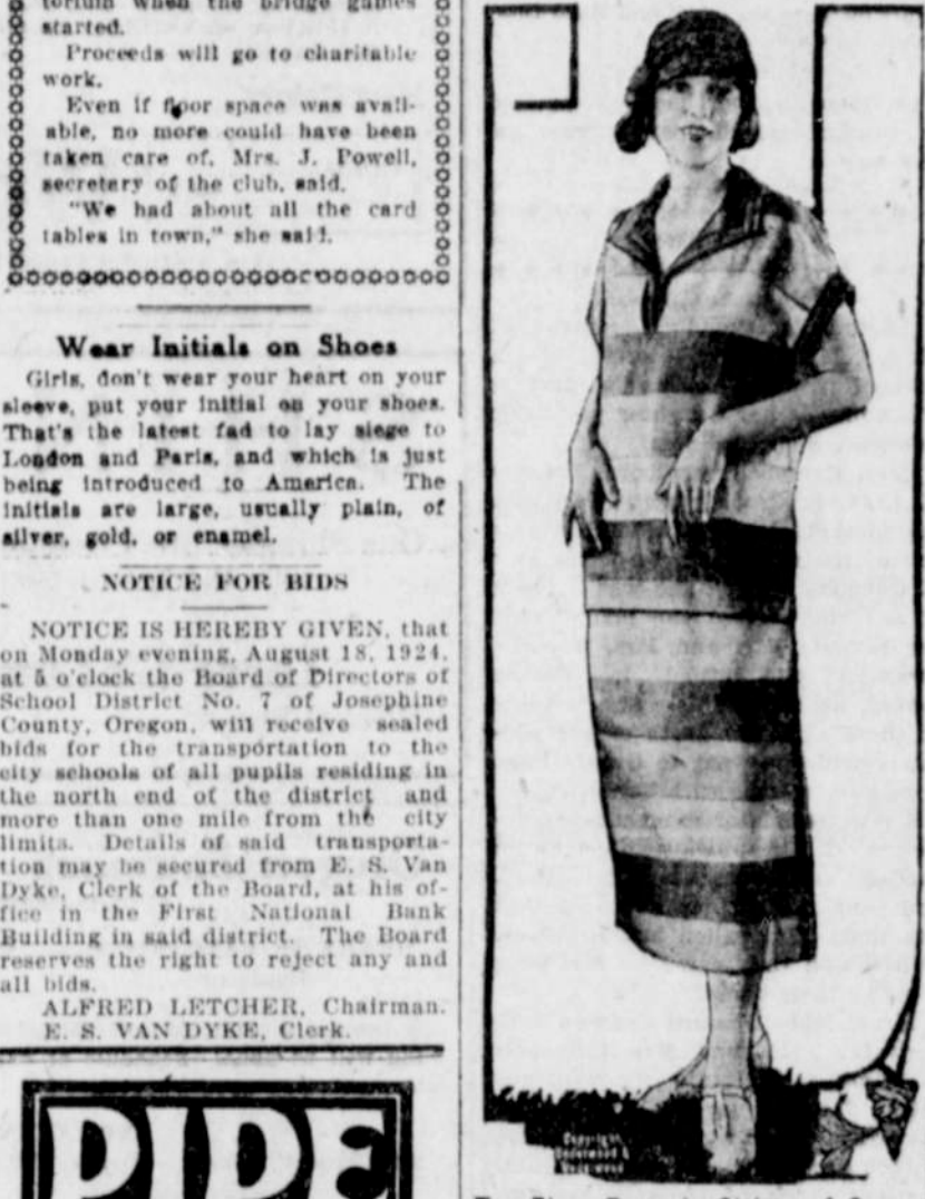
Two-Piece Dress in Stripes of Green, Tan and Blue.

Since a house dress is made pria good one that will keep its shape, dresses. Gingham is probably the favorite ma-